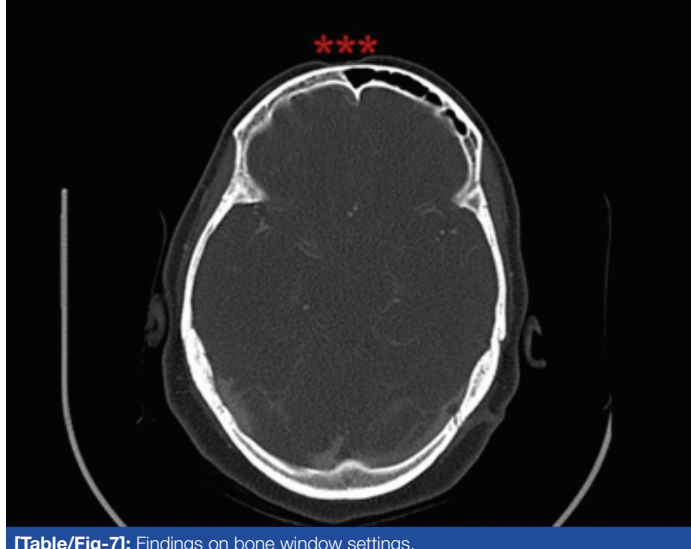
[Table/Fig-7]: Findings on bone window settings. There is seen evidence of cranial extension of the skin & subcutaneous tissues deficiency onto the right forehead region as well (***red triple asterisk).

of the zygoma & the zygomatic arch on the right side (**red double asterisk).